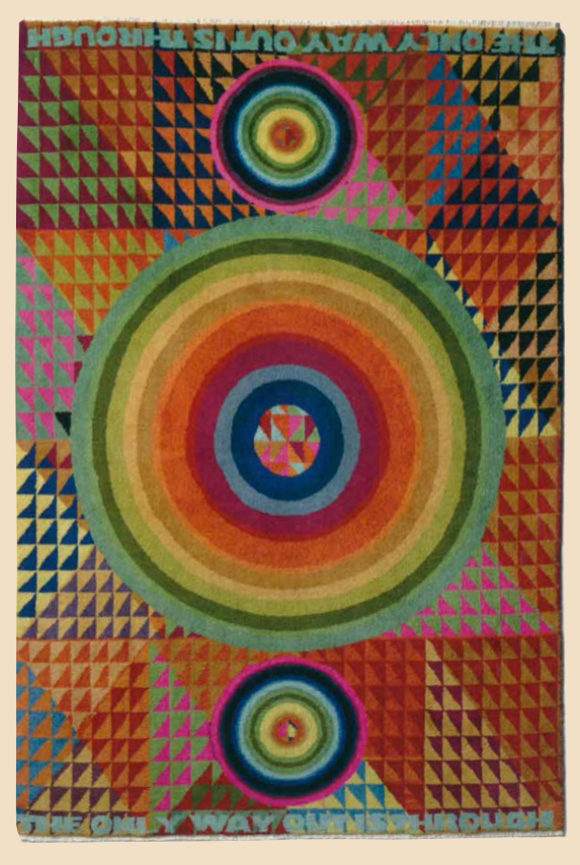
The title of Jeffrey Gibson's work, The Only Way Out is Through, is written on both ends of this carpet. What does that mean to you?