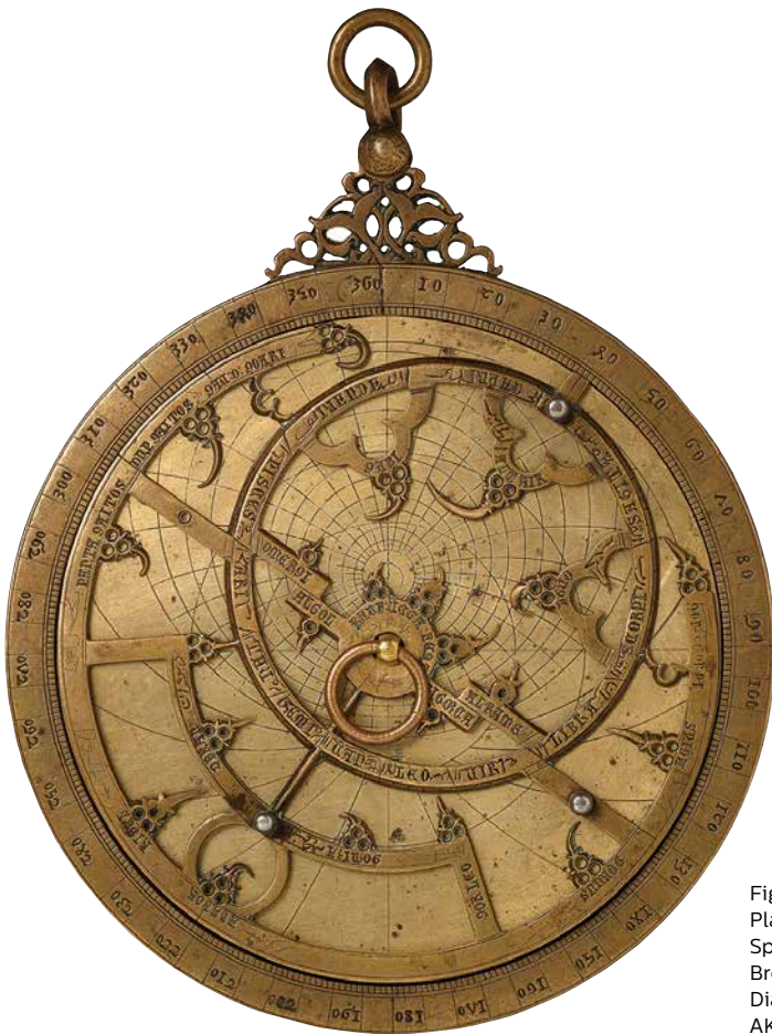
Figure 3: Planispheric Astrolabe Spain (Historic al-Andalus), 14th century Bronze inlaid with silver Diameter: 13.5 cm AKM611

Art objects can demonstrate how important the transmission of knowledge between different cultures and distant regions was for the advancement not only of artistic expertise, but also of scientific, medical, and engineering knowledge. One of the objects on show at the Aga Khan Museum is the Canon by Ibn Sina, a 10th-century philosopher who is considered the father of modern medicine. The Canon is both an illustrated manuscript handwritten on paper and a medical treatise. It exemplifies how Muslim scientists translated and developed Pre-Islamic knowledge from different sources, including Greeks, Indians, and Chinese. A 14th-century Spanish astrolabe is a masterwork of silver-inlaid bronze, a testament to pluralism through its inscriptions in Latin, Arabic, and Hebrew, and a scientific instrument. Both the Canon and the astrolabe are on show at the Aga Khan Museum.