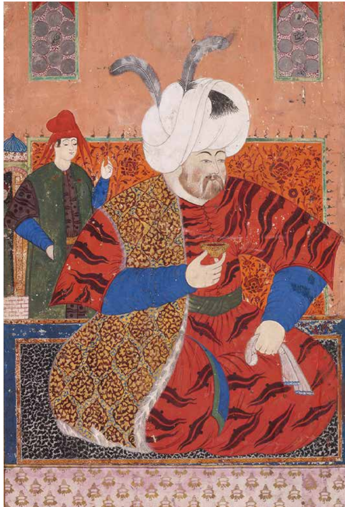
Figure 2: Portrait of Sultan Selim II Istanbul, Turkey, ca. 1570 Opaque watercolour and gold on paper 44.2 x 31.2 cm AKM219

The term Islamic art is inadequate to describe the vast diversity of art forms that have developed across expanses of Europe, Africa, and Asia, from Spain in the west to China in the east, and from the 7th century up to today. The Curriculum Resource Guide looks at the arts of Muslim societies as multiple and innovative forms whose development has continually influenced and been influenced by other regions and other cultures.