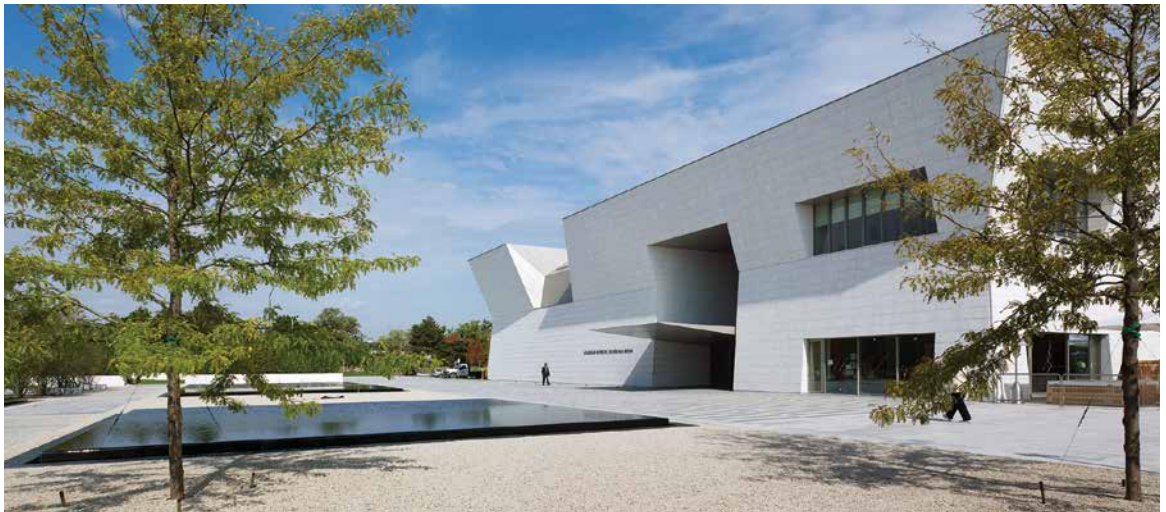
The Aga Khan Museum in Toronto, Canada.

The Aga Khan Museum is an art institution in Toronto, Canada, with an international scope and mission. It is dedicated to the collection, research, preservation, and display of works of art, objects, and artifacts of artistic, cultural, and historical significance from various periods and geographic areas where Muslim societies were predominant.